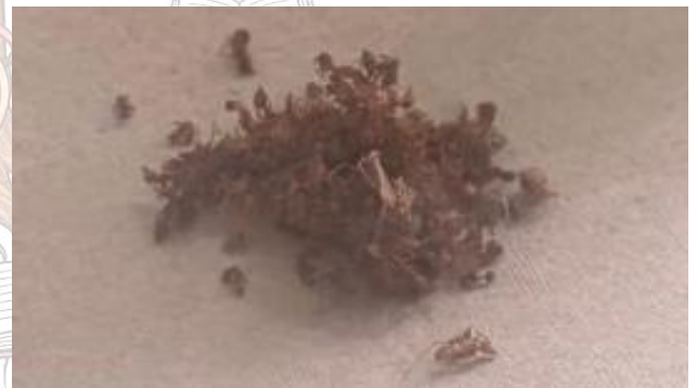
Figure 3: Picture showing dried sample of adults