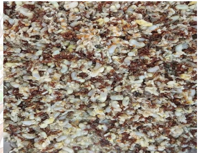
Figure 2: Specimen sample of adults and larvae

The intensity of this color, measured spectrophotometrically at 650 nm, correlates linearly with the protein concentration. Although the assay can be sensitive to interfering substances such as detergents and reducing agents, it remains more accurate than simpler methods like the Biuret test (Ma et al. , 2023; Lowry et al. , 1951; Sinha & Choudhury, 2024).