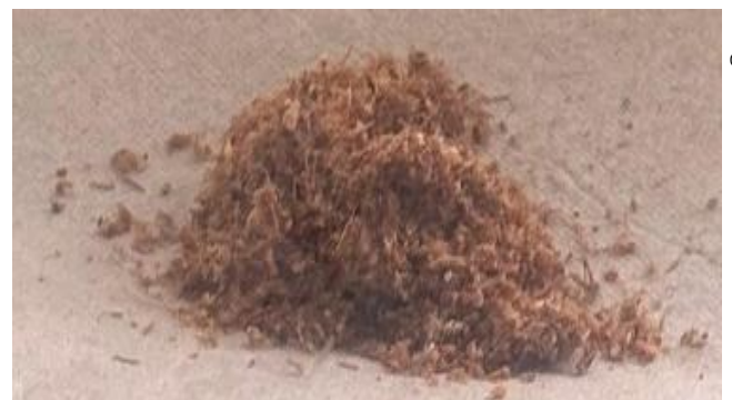
Figure 4: Picture showing dried sample of larvae