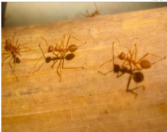
Figure 1: Picture showing Worker Weaver Ants.

Worker ants, known for their sour taste, are referred to as "mot som" and are commonly consumed, particularly their brood (eggs, larvae, and pupae), with a preference for the queen brood. The Mishing tribe and the Ahom community in Assam enjoy red ants ( Oecophylla smaragdina ) during the Bohag Bihu festival, with a strong belief that they can help prevent illness. In Pithra village in Jharkhand's Simdega district, people collect red ants and their eggs and cook them with mustard oil, salt, and spices. Additionally, some tribes prepare them as pickles or chutneys to accompany rice and local liquor (Chowdhury et al. , 2015; Kumar et al. , 2023; Van Itterbeeck et al. , 2014b).